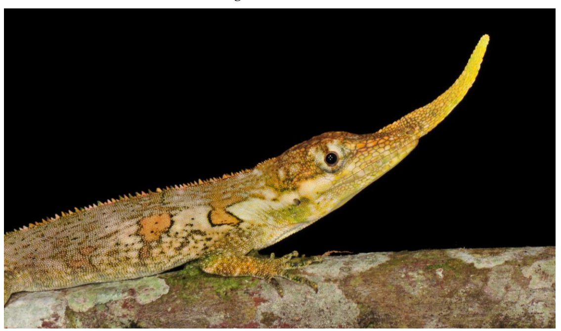
Fig. 2. Anolis proboscis, male.

I had found the first female of the species, but Eric and Ian had collected the trophy of the trip (Fig. 2). They showed me a plastic bag with a 70 mm lizard fumbling about, bending its preposterous snout extension against the transparent walls. It was beautiful, amazing, goofylooking. I couldn't stop staring at it, marveling at its weirdness. They recounted seeing it on the twig, how it moved its head sideways when disturbed and that was how they knew it was what it was. I could not believe our good fortune.