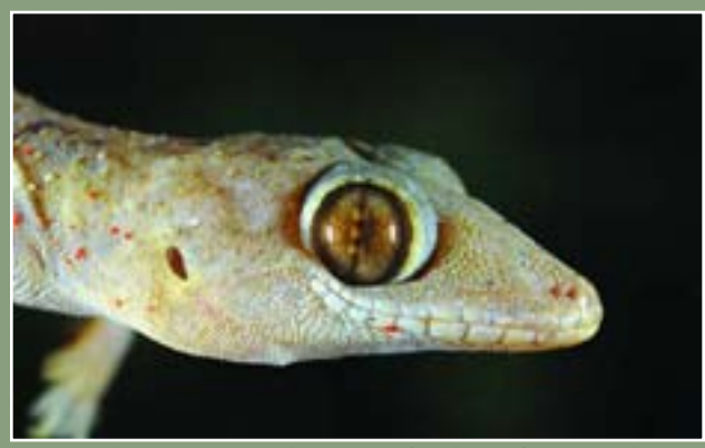
Cosmopolitan House Geckos ( Hemidactylus mabouia ) are human commensals that have become established throughout the tropics as a consequence of this close association (see article on p. 252).