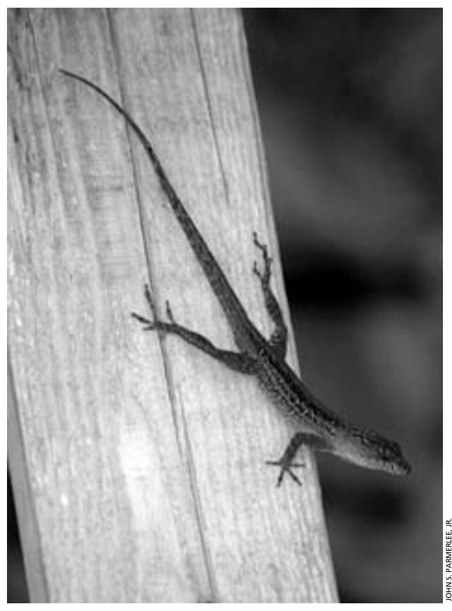
The Cuban Brown Anole ( Anolis sagret ) is an aggressive invader originating in Cuba. These lizards thrive in habitats altered by human activity.