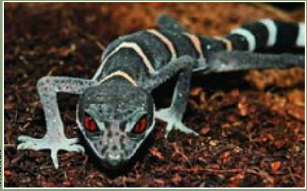
Goniurosaurus luii was described from southern China in the late 1990s. Within months, these geckos were demanding high prices in the pet trade (see commentary on p. 288).