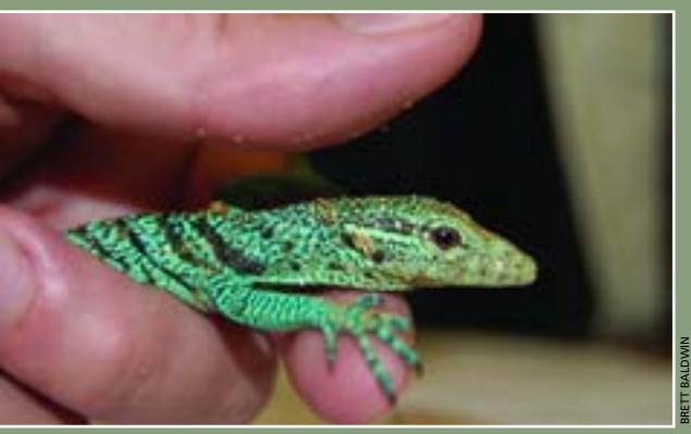
Green Tree Monitors ( Varanus prasinus ) have been successfully bred at the San Diego Zoo. Hatchlings are quite active and ready to disperse (see article on p. 283).