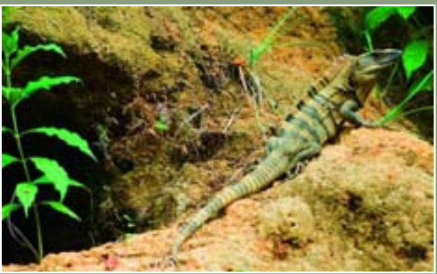
Ctenosaura similis may be an invasive species on Isla Utila, Honduran Bay Islands, where it could threaten the genetic integrity of the endemic C. barkeri population (see article on p. 264).