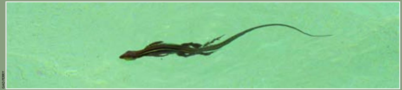
Puerto Rican Ground Lizards (Ameiva exsul) readily dove into the sea and swam both under and on the surface (see article on p. 272).