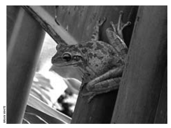
A Cuban Treefrog (Osteopilus septentrionalis) on an ornamental plant at the Beef Island nursery.

nly habitat loss is a bigger threat to native species than invasive species, which are found in increasing numbers in both terrestrial and aquatic habitats and cause over $100 billion in estimated economic damage every year in the United States alone (Pimentel et al. 2000). Such species often arrive via the transportation network (reviewed in Ruiz and Carlton 2003), whether voluntarily (intentional introductions) or involuntarily (accidental immigrants). That has been the case of the Cuban Treefrog (CTF), Osteopilus septentrionalis, which has been spreading in the Caribbean, primarily as a stowaway in ornamental plants and construction materials (e.g., Townsend et al. 2000, Powell et al. 2005, Powell 2006). In recent years, one of us has documented its ongoing expansion in the British Virgin Islands (BVI), where it is now known from breeding populations on Tortola, Virgin Gorda, Beef Island, and Peter Island (Owen et al. 2005, 2006). Single individuals have been documented on Necker Island and Guana Island, but searches of both in 2006 revealed no breeding populations, adults, or tadpoles. This frog is of concern for several reasons: It appears to cause the decline of native frogs, at least partially by direct predation; it also feeds on lizards, snakes, birds, and — primarily — invertebrates. In addition, it invades the water cisterns that are the main source of drinking water for many BVI residents, raising human health concerns.