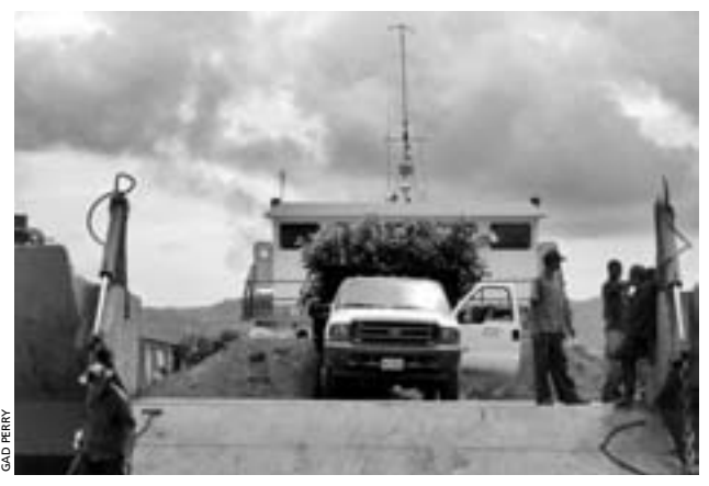
The barge, with its gate down, is ready to disgorge its load of plants and soil on Guana Island.

and sighted at least one other that was not recovered. In the soil of the planters, we collected one dwarf gecko, later identified as a native Sphaerodactylus macrolepis . In addition, we recovered one immature spider (an unidentified member of the genus Selenops ; catalog number TTU-Z 31,098) and three individual snails, Zachrysia provisoria (MCZ 356974). This species originates in Cuba, but has been reported in Florida and elsewhere in the Caribbean, including the U.S. Virgin Islands (A. Baldinger, pers. comm.; Kraus 2005). The soil in two pots contained nests of the imported Red Fire Ant ( Solenopsis invicta ), and had to be fumigated. This species is not listed among those