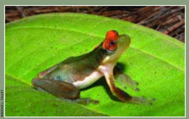
The recently described bromeliad-dwelling frog Hyla melacaena is the only species of frog known to occur in the dwarf forests of Cusuco National Park, Honduras (see article on p. 242).