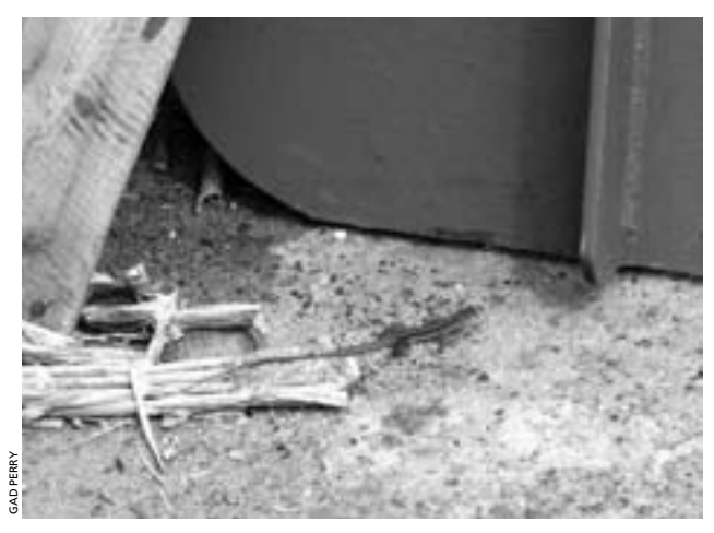
One of two juvenile ground lizards ( Ameiva exsul ) encountered on the barge.