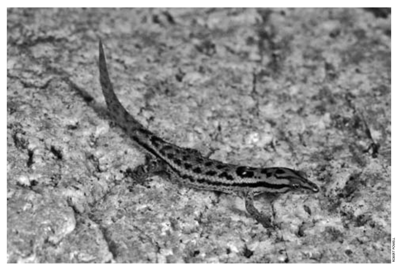
This dwarf gecko, Sphaerodactylus macrolepis, is common in the British Virgin Islands.