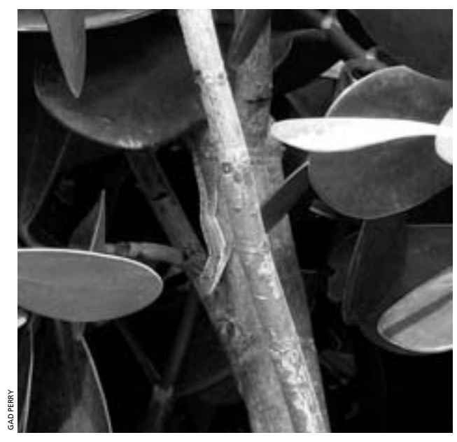
A juvenile Crested Anole ( Anolis cristatellus ) on a nursery plant on top of a truck loaded on the barge. The animal escaped before it could be captured.

In addition to these cargo-related species, we recovered two juvenile ground lizards, later identified as the native Ameiva