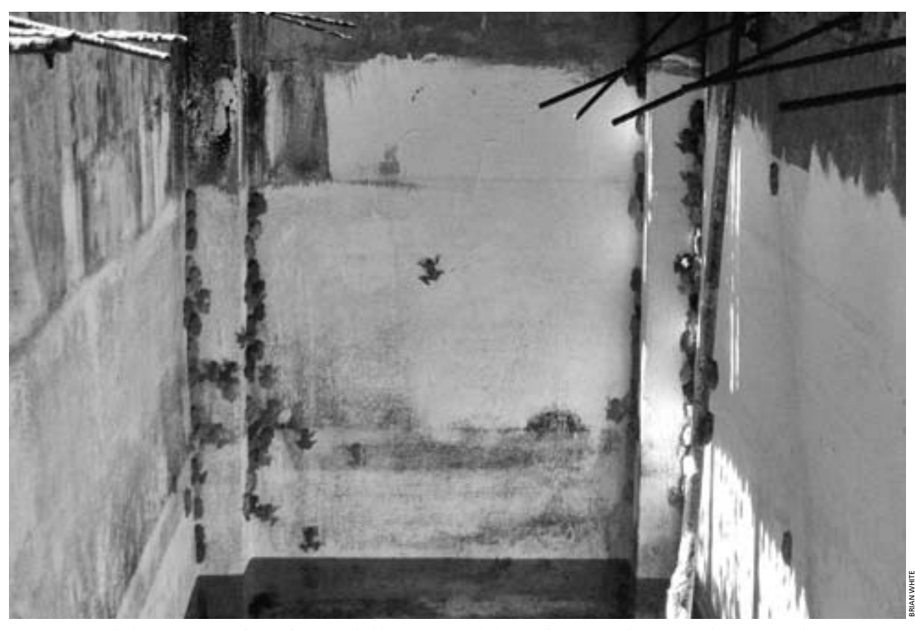
A cistern on Beef Island, the source of water for a household, is teeming with dozens of Cuban Treefrogs (Osteopilus septentrionalis).