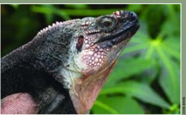
Exuma Island Iguanas ( Cyclura cychlura figginsi ) populations are increasingly affected by a growing number of tourists visiting the islands (see related reports on p. 278).