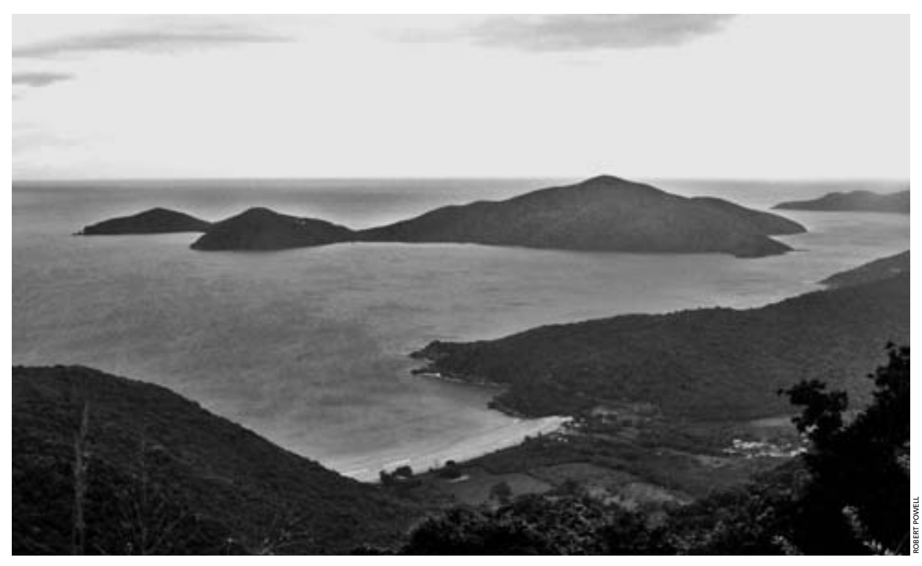
Guana Island, like the many other islands of various sizes that comprise the British Virgin Islands, is separated from other islands only by short distances across intervening channels. As part of the Greater Puerto Rico Bank, these islands were once connected when sea levels were much lower than today. At least those populations of plants and animals with limited abilities to disperse across water have evolved separately on individual islands, and efforts should be made to avoid diluting potentially unique gene pools by transferring even common species from island to island.