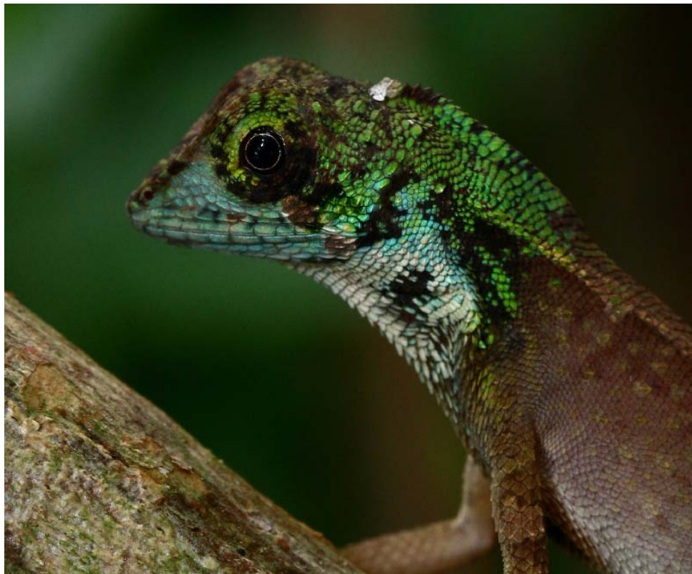
FIG. 2. A mature male of Otocryptis wiegmanni while compressing its dewlap. Macho adulto de Otocryptis wiegmanni comprimiendo su saco gular.

During the fight, their tails appeared suddenly with black,