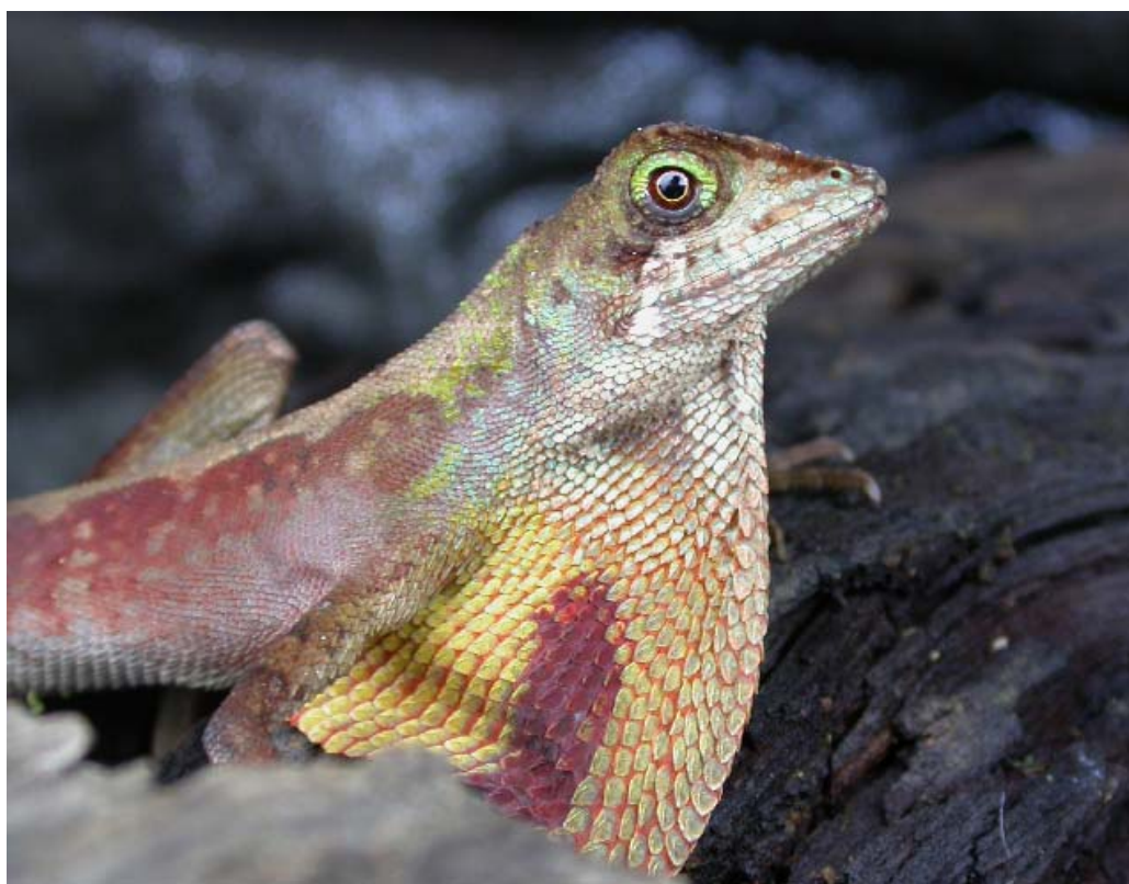
FIG. 1. A mature male of Otocryptis wiegmanni while expanding its dewlap. Macho adulto de Otocryptis wiegmanni expandiendo su saco gular.

1992). The amount of leaf litter on the ground was thick and wet. The canopy cover is about 70% and the undergrowth was very poor. The soil is soft and it contains blackish brown earth. The dominant tree species are Madhuca fulva (Family: Sapotaceae), Mangifera zeylanica (Family: Anacardiaceae), Dipterocarpus zeylanicus (Family: Dipterocarpaceae), Mesua ferrea (Family: Clusiaceae), and Shorea zeylanica (Family: Dipterocarpaceae).