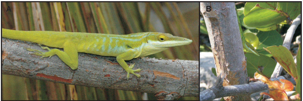
Figure 1. A, Picture of an adult male Anolis maynardi from Little Cayman in its native evergreen shrubland habitat illustrating the greatly elongated rostrum. (B) Picture of a male A. maynardi in the sea grape habitat where it was very abundant on Little Cayman.

* n = 16 ; ** n = 9 . Table entries are means ± standard deviations.